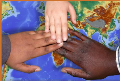
Behaviour & Attitudes