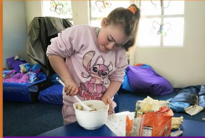
Effort & Resilience

Our values are at the core of everything we do and have been developed with the aim of preparing our pupils to be confident, happy and compassionate citizens.